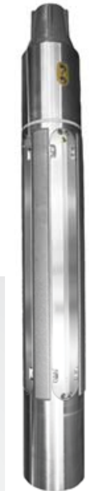
Diagram of Near Bit System used with Electric Dipole System

The 3.5 API Regular sub has four pockets, one each for inclinometer, gamma, transmission electronics, and battery. The 4.5 API Regular sub has five pockets, with the same contents as the 3.5 API Regular sub, but with an extra battery. Battery life is typically between 80 - 120 hours per single battery stack.